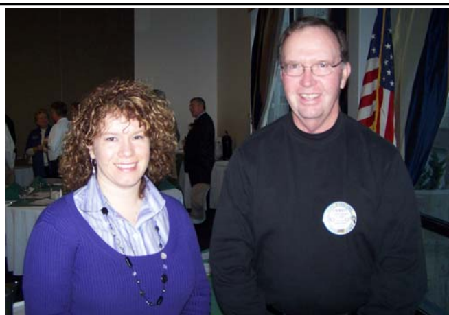
Lockett Garnett hosted a speaker from Operation Blessing last week.

Convenient local and online make-up meeting locations are on the back!